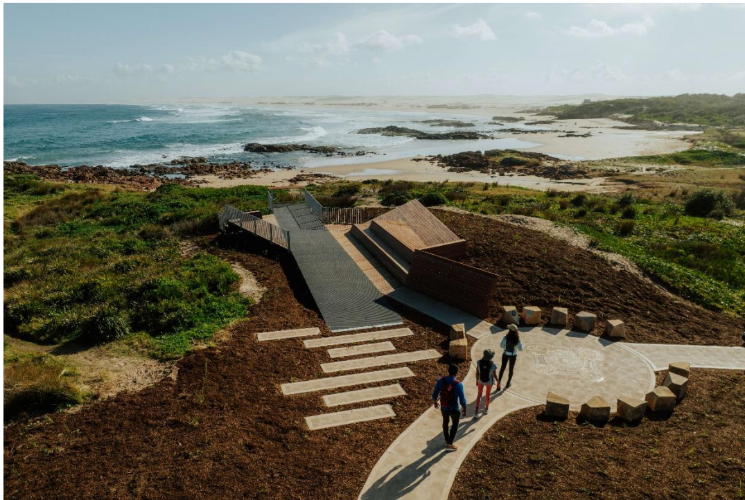
Photo: New lookout at Birubi Point Aboriginal Place, Tomaree Coastal Walk. D.Parsons/DPE.