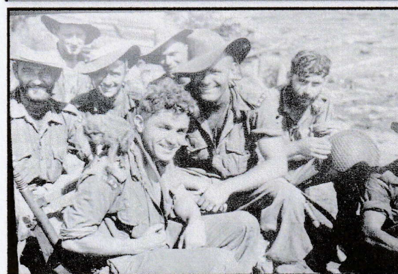
Royal Australian Naval Commandos at HMAS Assault, Little Beach, 1942